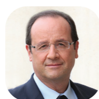
Francois Hollande The 24 th President of France