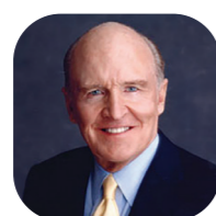
Jack Welch Former Chairman of General Electric