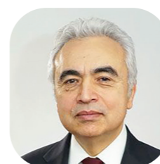
Fatih Birol Executive Director of International Energy Agency(IEA)