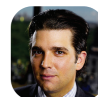
Donald Trump Jr. Executive Vice President of the Trump Organization