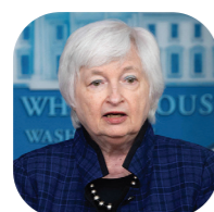
Janet L. Yellen The 78 th United States Secretary of the Treasury