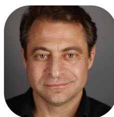
Peter Diamandis Founder & Executive Chairman of XPRIZE Foundation