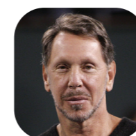
Larry Ellison Chairman & CTO of Oracle Corporation