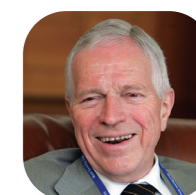
Edmund Phelps 2006 Nobel Prize Laureate in Economics