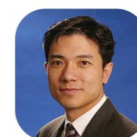
Robin Li Chairman & CEO of Baidu