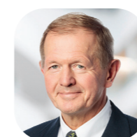
Marcus Wallenberg Chair of the Board of Directors of Skandinaviska Enskilda Banken (SEB)