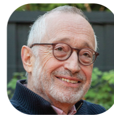
Paul Milgrom Professor at Stanford University