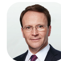
Mark Schneider CEO of Nestlé