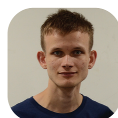
Vitalik Buterin Creator of Ethereum