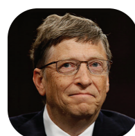
Bill Gates Co-founder of Microsoft Corporation