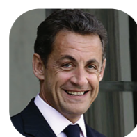
Nicolas Sarkozy The 23 rd President of France