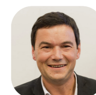
Thomas Piketty Professor at Paris School of Economics