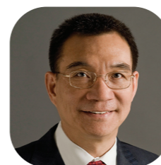
Justin Yifu Lin Professor at National School of Development Peking University