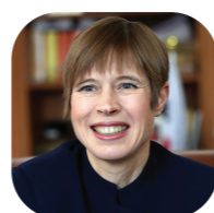
Kersti Kaljulaid The 5 th President of Estonia