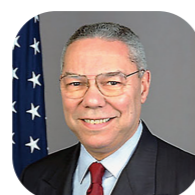
Colin Powell The 65 th United States Secretary of state