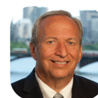
Lawrence Summers The 8 th Director of the National Economic Council