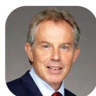
Tony Blair The 73 rd Prime Minister of United Kingdom