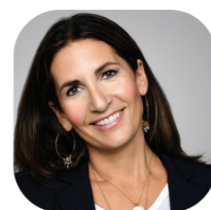
Bobbi Brown Founder of Bobbi Brown Cosmetics