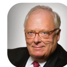
Edwin Feulner Founder of The Heritage Foundation