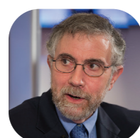
Paul Krugman Professor at City University of New York