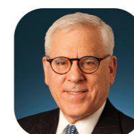
David Rubenstein Co-founder & Co-CEO of the Carlyle Group