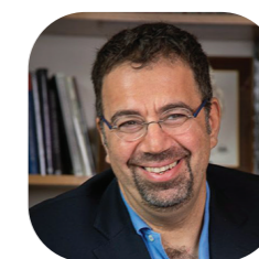
Daron Acemoglu Professor at MIT