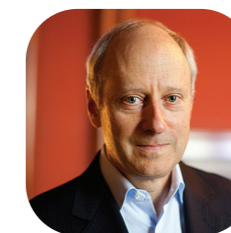
Michael Sandel Professor at Harvard University