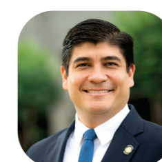
Carlos Alvarado The 48 th President of the Republic of Costa Rica