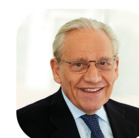
Bob Woodward Pulitzer Prize-Winning Journalist