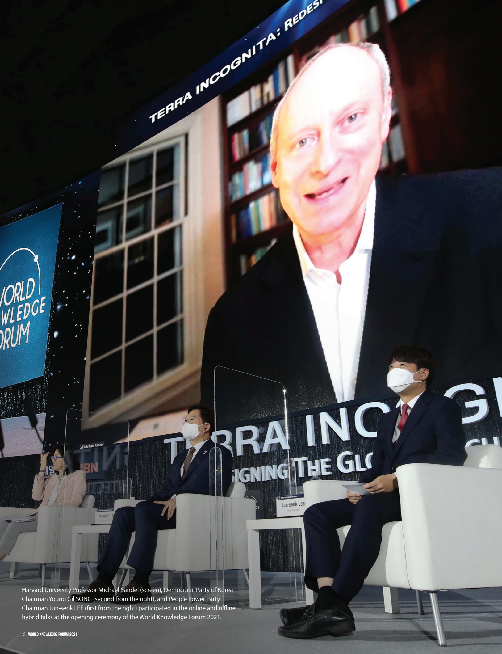
Harvard University Professor Michael Sandel (screen), Democratic Party of Korea Chairman Young Gil SONG (second from the right), and People Power Party Chairman Jun-seok LEE (first from the right) participated in the online and offline hybrid talks at the opening ceremony of the World Knowledge Forum 2021.