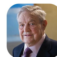
George Soros Chair of Soros Fund Management