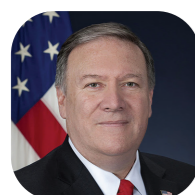
Mike Pompeo The 70 th United States Secretary of State