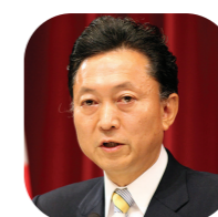
Yukio Hatoyama The 93 rd Prime Minister of Japan