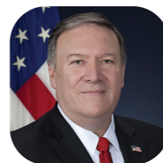
Mike Pompeo The 70 th United States Secretary of State