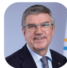
Thomas Bach President of International Olympic Committee(IOC)