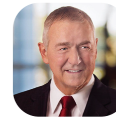
Jim Goodnight Co-founder & CEO of SAS Institute