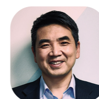
Eric Yuan Founder & CEO of Zoom