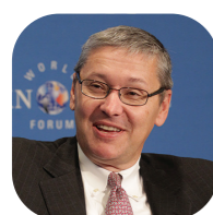
Gregory Mankiw Professor at Harvard University