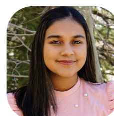
Gitanjali Rao TIME's 2020 Kid of the Year