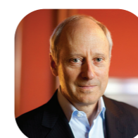
Michael Sandel Professor at Harvard University