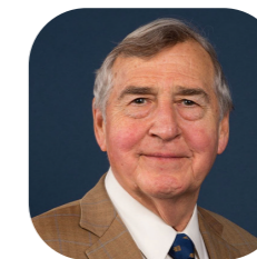
Graham Allison Professor at Harvard University