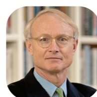
Michael Porter Professor at Harvard University