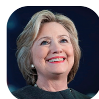
Hillary Rodham Clinton The 67 th United States Secretary of State