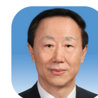
Wang Jia Rui Vice Chairman of the 12 th National Committee of the Chinese People's Political Consultative Conference