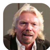
Richard Branson Founder of Virgin Group