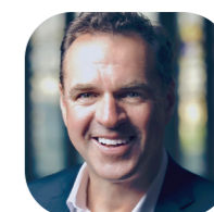
Niall Ferguson Senior Fellow at the Hoover Institution