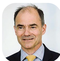
Warren East CEO of Rolls Royce