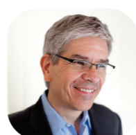
Paul M. Romer Professor at NYU Stern