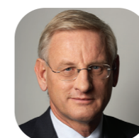
Carl Bildt The 40 th Prime Minister of Sweden & GCIG Commissioner