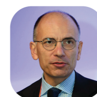
Enrico Letta The 55 th Prime Minister of Italy