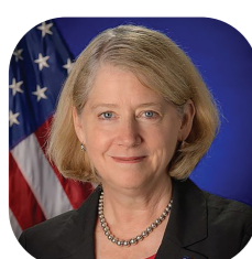
Pamela Melroy Deputy Administrator of NASA