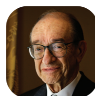
Alan Greenspan The 13 th Chairman of Federal Reserve Board