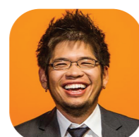
Steve Chen Co-founder of YouTube