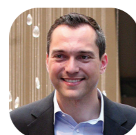
Nathan Belcharczyk Co-founder of Airbnb