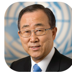
Ban Ki-moon The 8 th Secretary General of United Nations