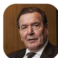
Gerhard Schröder The 7 th Chancellor of Germany