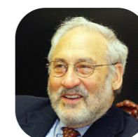
Joseph E. Stiglitz 2001 Nobel Prize Laureate in Economics