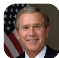
George W. Bush The 43 rd President of the United States