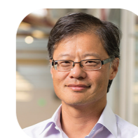
Jerry Yang Co-founder & former CEO of Yahoo