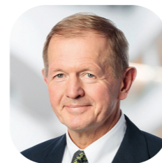
Marcus Wallenberg Chair of the Board of Directors of Skandinaviska Enskilda Banken (SEB)