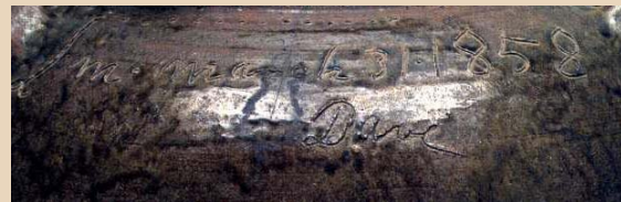
L.m. March 31, 1858 / Dave

On the reverse: I made this for our Sott / It will never never rott