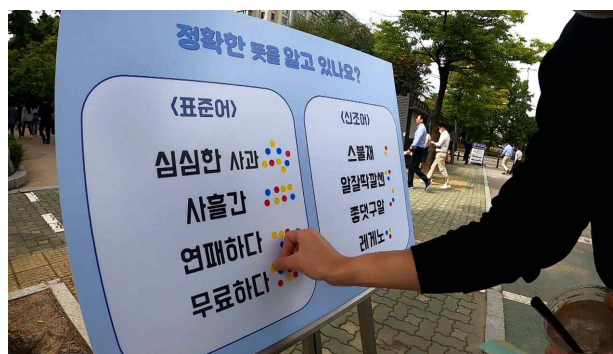
Recent controversy over people's Korean literacy ( KBS News, Oct. 22, 2022 )

The increasing number of cases in which Korean is used in the lyrics of popular songs by foreign singers shows that the popularity of Hangeul is also increasing due to the 'Korean Wave'. On the other hand, recent controversy over Korean people's Korean literacy, triggered by a "boring apology" on the Internet, throws concerns about an uncommunicated society that has gone one step further from the previous debate on the so-called "alien language" by young generations such as "Aljalttakkalsen" that cannot be understood by their seniors( KBS News, October 22, 2022 ).