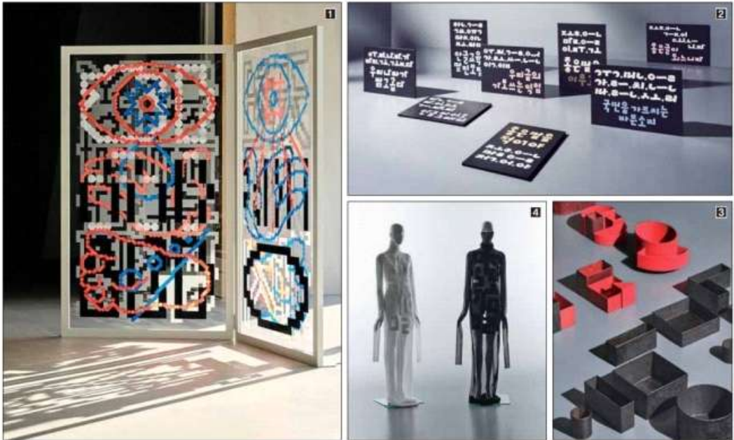
The transformation of Hangeul: Beyond text to become art (Seoul Newspaper, Oct. 10, 2022)

And the argument “Enact a Romanization system for reading Hangeul” ( Hankyoreh Newspaper, October 5, 2022 ) seems analog at first glance, but it may be a necessary change in the age of AI civilization. There is a need for the new principle of English notation of Hangeul suitable for the era in which artificial intelligence finds and translates use cases. Articles such as “The transformation of Hangeul: Beyond text to become art” are actually not so new( Seoul Newspaper, October 10, 2022 ). Rather, I feel a little disappointed with the fact the final report of the “ Study on the estimation of social value and industrial size of Hangeul and Korean language ” commissioned by the Ministry of Culture in 2020 is not found yet. Even if you look at the private education market in Korea alone, the economic scale of the English industry is enormous. It is time to estimate the Hangeul’s industrial value that will grow as the status of Hangeul rises.