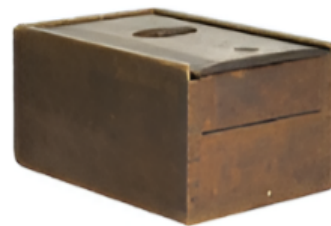
A kind of a charity box placed in churches