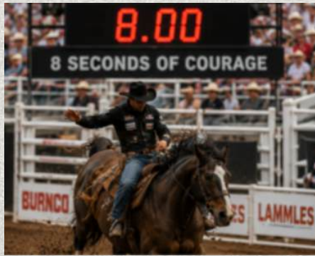
→ They try to survive the rough rides for eight seconds.