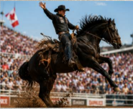
→ They hold onto wild horses with only one hand.