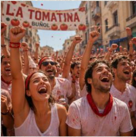
→ Over twenty thousand people expect a day of wild fun.