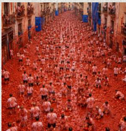
→ People turn the entire town into a red sea.