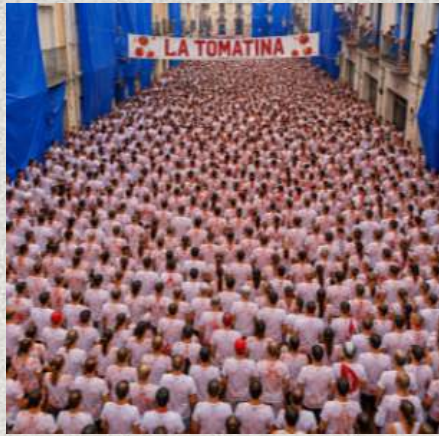
→ Over twenty thousand people pack the narrow streets in white T-shirts.