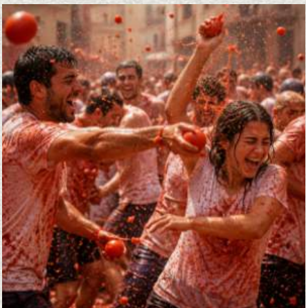
→ People throw the squashed fruits at each other for an hour.