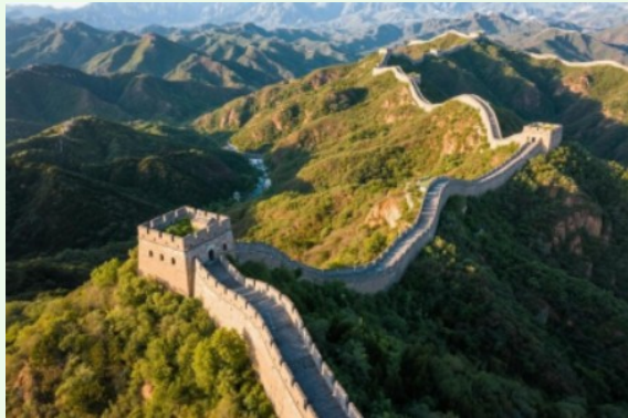
Great Wall (China) A long wall built to protect China from enemies in the past