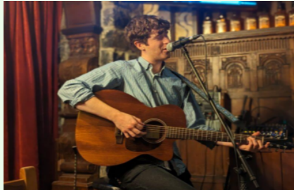
Danny Boy (Ireland) A traditional Irish folk song about sadness and farewell