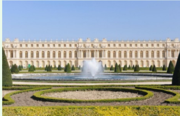
Palace of Versailles (France) A royal palace where kings used to live