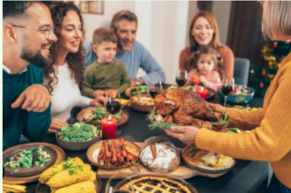
Thanksgiving (USA) Family holiday with food

STEP 1. Choose a Culture 아래의 문화/풍습 중 한 개를 선택합니다.