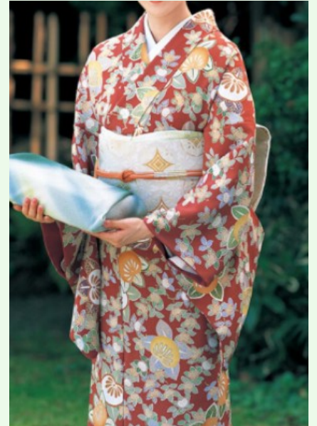
Kimono (Japan) Traditional clothing