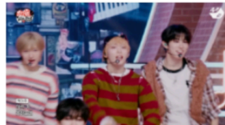
ikegami EFP 3