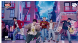
ikegami EFP 2