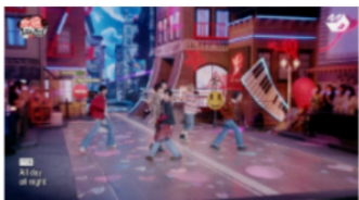
ikegami EFP 1