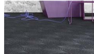
Black Art Vulcano Carpet - winner red dot award: product design 2010