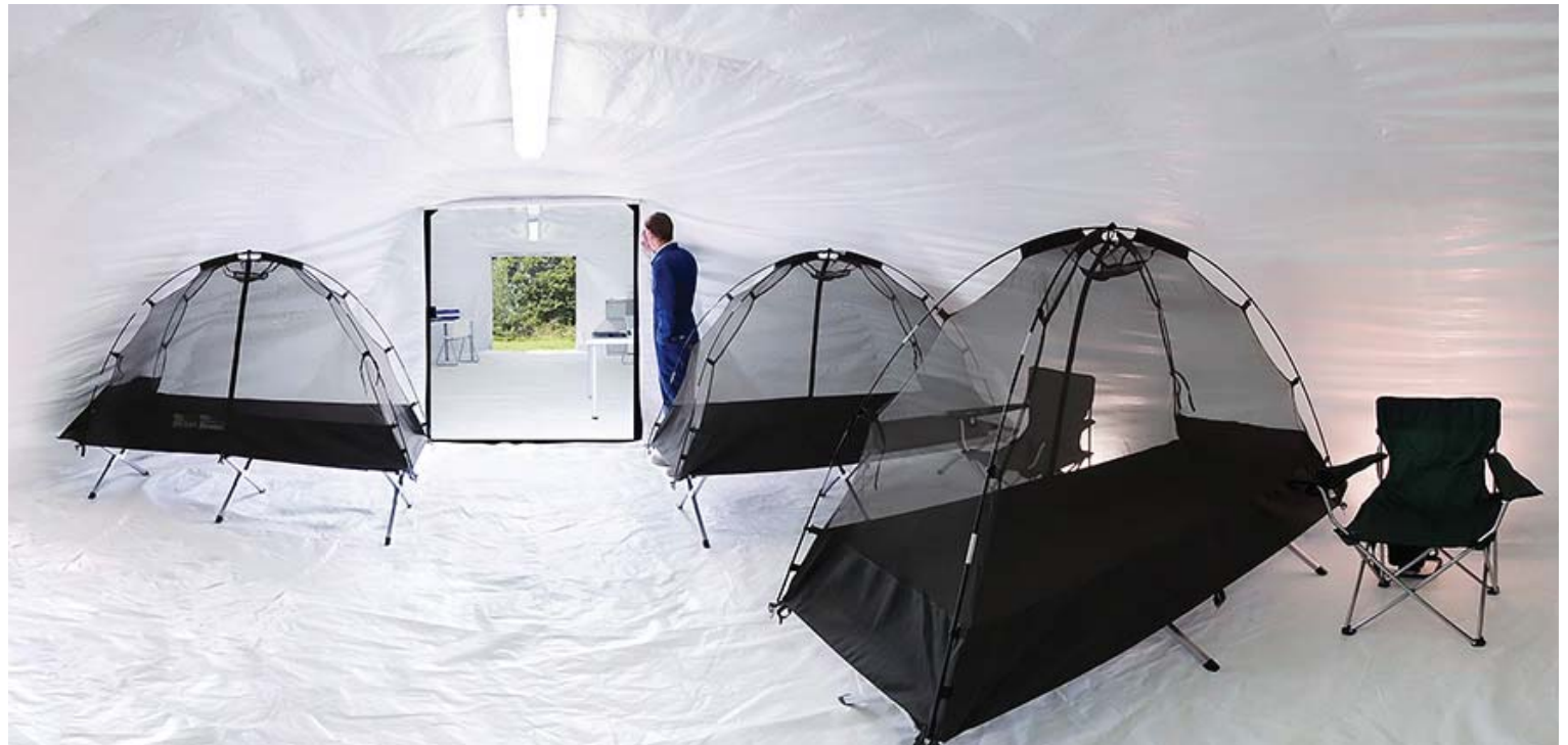
Internal view of docked CCS54s

CCS structures are designed as part of a modular system; units can be easily linked together enabling the space to be tailored to the application. CCS are designed as generic structures with initial uses as accommodation, field offices and secure storage. Small openings for services can be cut or drilled in the Concrete Cloth shell. Larger openings for windows can be cut but require bolted frames to distribute the stress. CCS can be demolished using basic tools. The thin walled structure has a very low mass leaving little material for disposal.