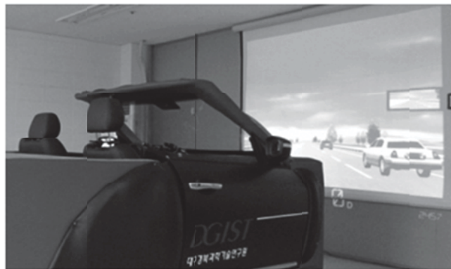
Figure 1. The DGIST driving simulator

The experiment was conducted in the DGIST fixed-based driving simulator, which incorporated STISIM Drive™ software and a fixed car cab (see Figure 1). Graphical updates to the virtual environment were computed using STISIM Drive™ based upon inputs recorded from the OEM accelerator, brake and steering wheel which were all augmented with tactile force feedback. The virtual roadway was displayed on a 2.5m by 2.5m wall-mounted screen at a resolution of 1024 x 768. Sensory feedback to the driver was also provided through auditory and kinetic channels. Distance, speed, steering, throttle, and braking inputs were captured at a nominal sampling rate of 30 Hz. Physiological data were collected using a MEDAC System/3 unit and NeuGraph™ software (NeuroDyne Medical Corp., Cambridge, MA). A display was installed on the screen beside the rear-view mirror to provide information about the elapsed time and the distance remaining in the drive. The simulator configuration, STISIM Drive™ protocols, and physiological monitoring equipment and sensor attachment methods were all selected and implemented in consultation with the MIT AgeLab and New England Univeristy Transportation Center to specifically support cross laboratory, country and cultural collaborative and replication studies (Son, Reimer, Mehler, Pohlmeier, et al., 2010).