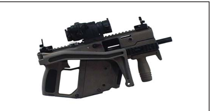
KRISS Super V XSMG Prototype .45 ACP