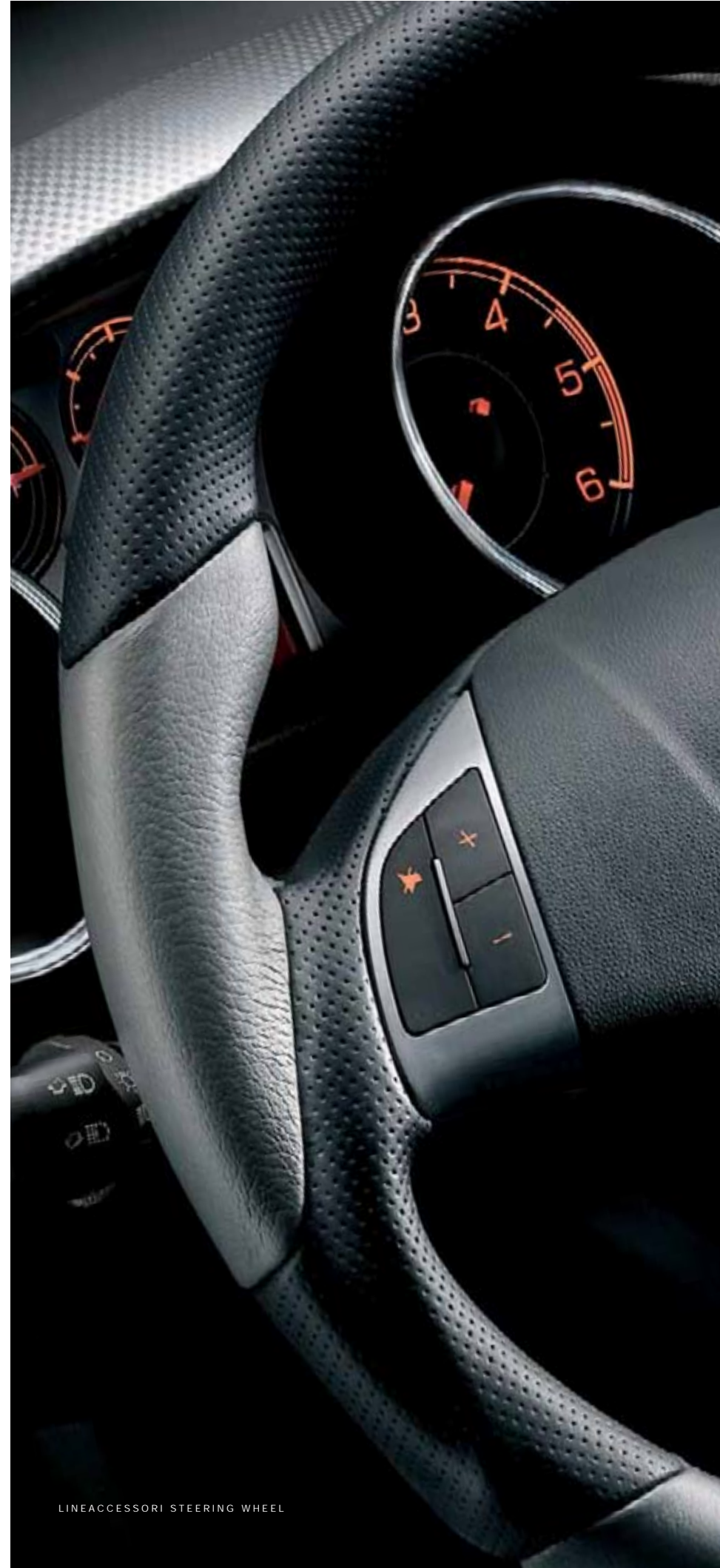
LINEACCESSORI STEERING WHEEL